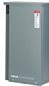
100 Amp with optional status indicator shown.